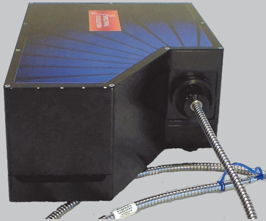
The SR-4500 has a fixed fiber mount that pairs the optical slit and fiber at the connection. The mount allows fibers to be interchanged if longer fibers are needed for a unique application.